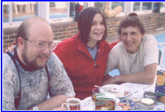
Trans parents with their daughter. The father in this case, is also the natural mother and therefore automatically has parental responsibility for their daughter.

However, in some cases, the consent of any adult(s) having Parental Responsibility is not necessary if the young person under sixteen is deemed, by the doctor, to be 'Gillick' competent 13 according to the Fraser guidelines.